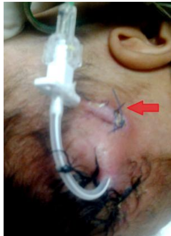
Fig. 3: Anchoring knot of the tube has cut through the skin with proximal migration of EVD tubing.

Soon after under sterile circumstances the EVD tube was pulled till the desired length had remained