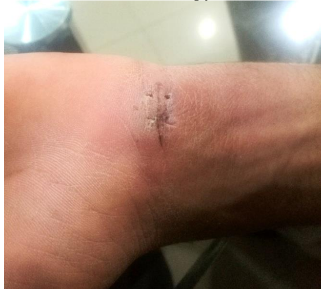
Fig. 1: Transverse 1 cm skin incision for retinaculotomy (printed after obtaining written consent from the patient).

Rest of the part is sort of blind cutting after feel with a scissor tip in backward dragging of the instrument under TCL and then cut accordingly.