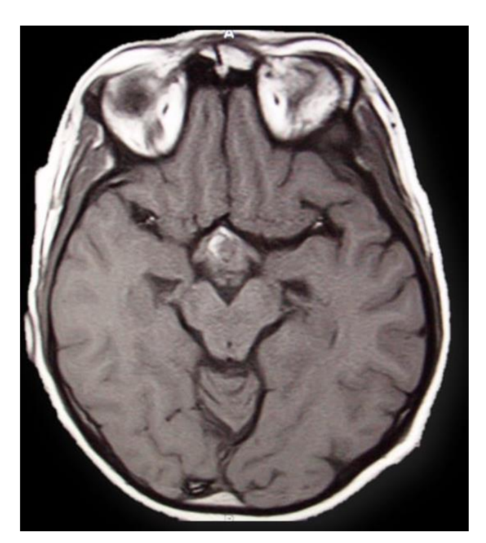
Fig. 3: Result of Craniopharyngioma after One-Year Follow-up.