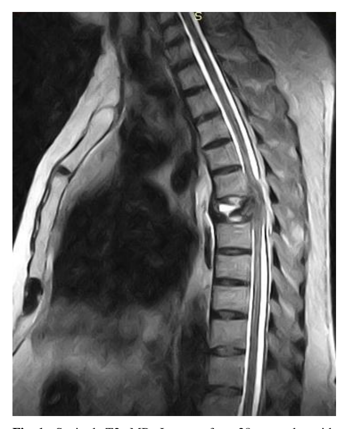
Fig. 1: Sagittal T2 MR Image of a 28 y male with involvement of D8 vertebra. The presenting signs were backache, lower limb weakness and sphincter dysfunction.

We observed postoperative worsening of neurological function in 3 (9.7%). Two of the patients progressed from 4/5 power in the lower limbs to 1/5. All of these patients recovered their function to 3/5 at the end of 1<sup>st</sup> month postoperatively, but never improved to complete neurological function. One patient remained static in terms of neurological recovery despite adequate decompression and