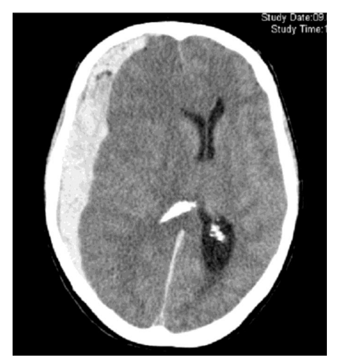
Fig. 2: CT scan of Acute Subdural Hematoma.