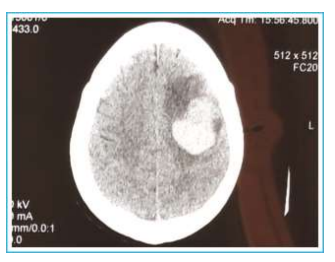
Figure 2: CT BRAIN showing hyperdense hematoma with surrounding edema.