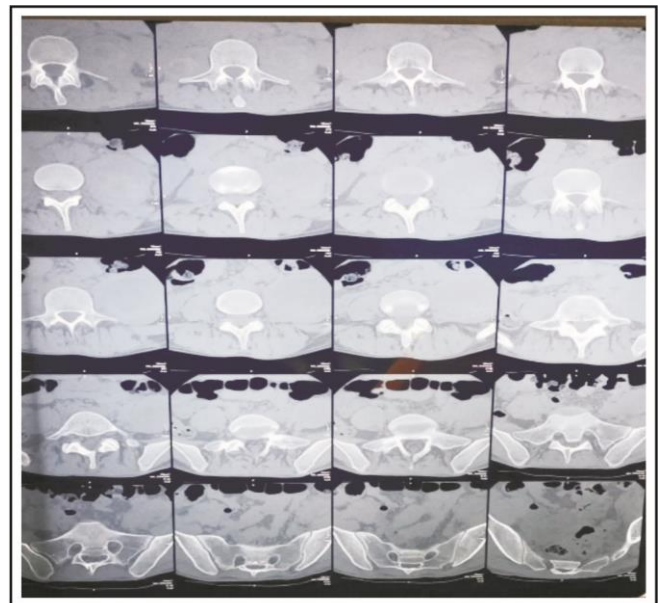
Figure 2: Axial cut CT dorsolumbar spine showing the complete collapse of D12-L1 with the compromised canal. (The scan is included with the consent of the patient).