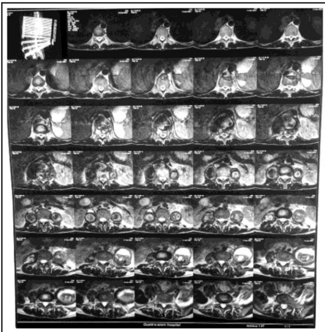
Figure 4: Axial T 2 WT MRI Dorsolumbar spine again showing bilateral psoas abscess from D11 through L4 – 5 with D12 – L1 collapse with thecal indentation and kyphotic deformity. (The scan is included with the consent of the patient).

disc with thecal sac indentation hyperintense T2 WT cord changes at D11 D12 along with kyphotic