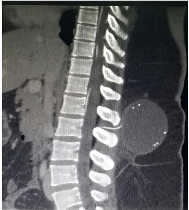
Fig. 3: Well circumscribed cystic lesion is seen in the subcutaneous tissues of the back, posterior to L1 and L2 spinous processes measuring 6.4 \times 5.2 \times 7 cm in antero-posterior, transverse and craniocaudal respectively, with the shunt tube coiled within its cavity.