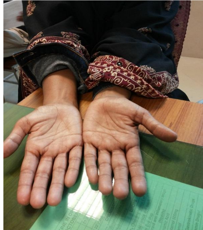
(b) Hands of affected patient