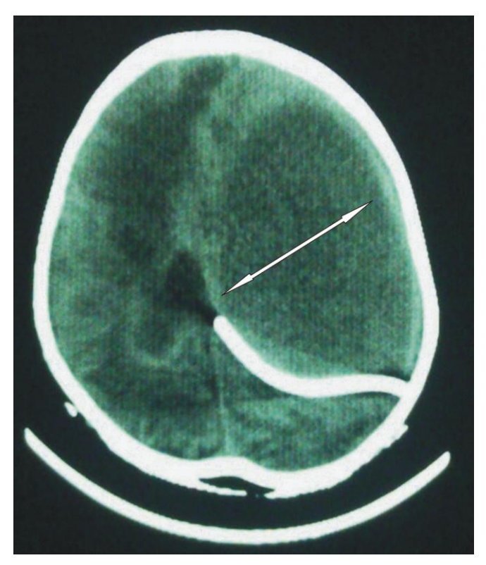
Figure 3: Abscess with a VP shunt in-situ (a rare complication).

in large similar to the findings of other studies, despite some variability in frequencies of different clinical features. Clinical studies by Shachor – Meyouhas et al,<sup>14</sup> Auvi-chayapat et al<sup>15</sup> and Goodkin et al,<sup>16</sup> on cerebral abscess in children has shown similar results, where mean age was 8 \pm 2 years, male to female ratio of 2:1 to 3:1, and a high incidence of convulsions with headaches, fever, neurological signs convulsions, (41%, 81%, 78% and 41% respectively). These studies have also found CHD as the most common cause while otitis media was less common.<sup>14-16</sup>