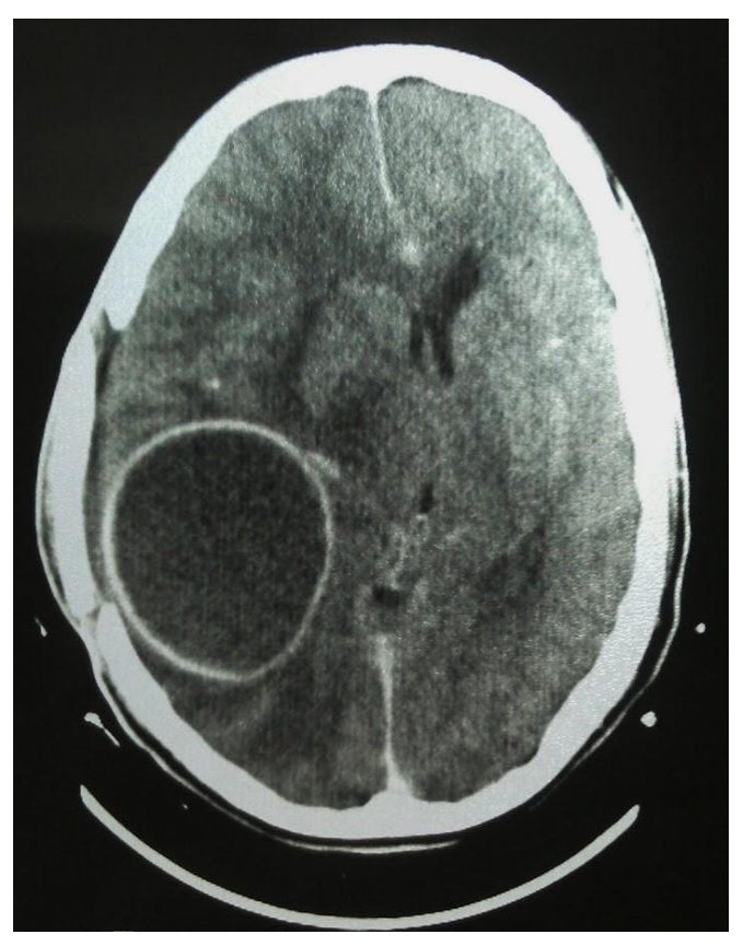
Figure 4: Right Parietotemporal brain abscess (CT Brain with contrast).

Although gram positive cocci are frequently responsible for development of brain abscess in majority of cases, in the present study however, E. coli was found to represent the most common infectious agent, followed by streptococci, staphylococci, pneumococci, pseudomonas and listeria. These findings are similar to the bacteriological findings of large studies by Hsiao et al, and Mace et al.<sup>18,19</sup> Mehnaz et al,<sup>4</sup> has shown the causative pathogens specifically within the population of children with CHDs and also in relation to the occurrence of meningitis and septicaemia. E. Coli and streptococcus was found in majority of abscesses cultured from these patients.<sup>4,12</sup> However, in our study 54.2% (26) cases revealed no bacterial growth on pus culture, probably due to the fact that most patients were receiving intravenous antibiotics many days or weeks before surgery.<sup>2</sup>