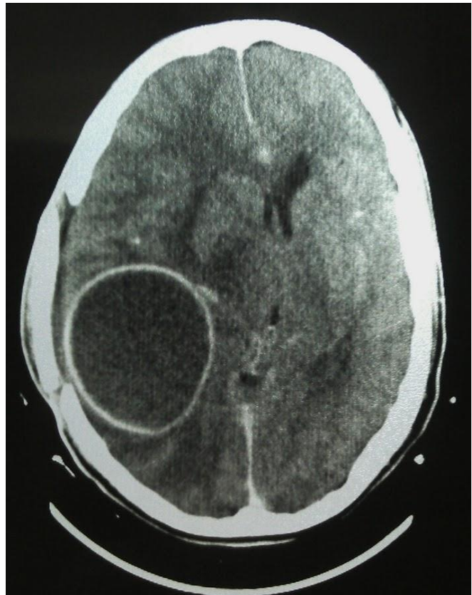
Figure 4: Right Parietotemporal brain abscess (CT Brain with contrast).

Although gram positive cocci are frequently responsible for development of brain abscess in majority of cases, in the present study however, E. coli was found to represent the most common infectious agent, followed by streptococci, staphylococci, pneumococci, pseudomonas and listeria. These findings are similar to the bacteriological findings of large studies by Hsiao et al, and Mace et al. 18,19 Mehnaz et al, 4 has shown the causative pathogens specifically within the population of children with CHDs and also in relation to the occurrence of meningitis and septicaemia. E. Coli and streptococcus was found in majority of abscesses cultured from these patients. 4,12 However, in our study 54.2% (26) cases revealed no bacterial growth on pus culture, probably due to the fact that most patients were receiving intravenous antibiotics many days or weeks before surgery. 2